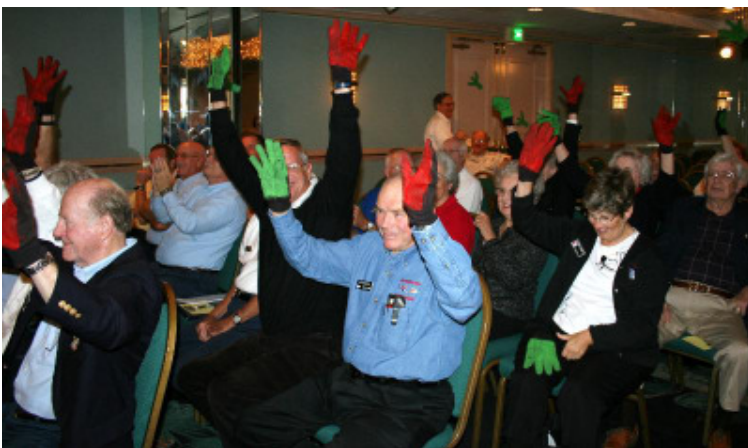
Best in Show - Mariner's Gloves