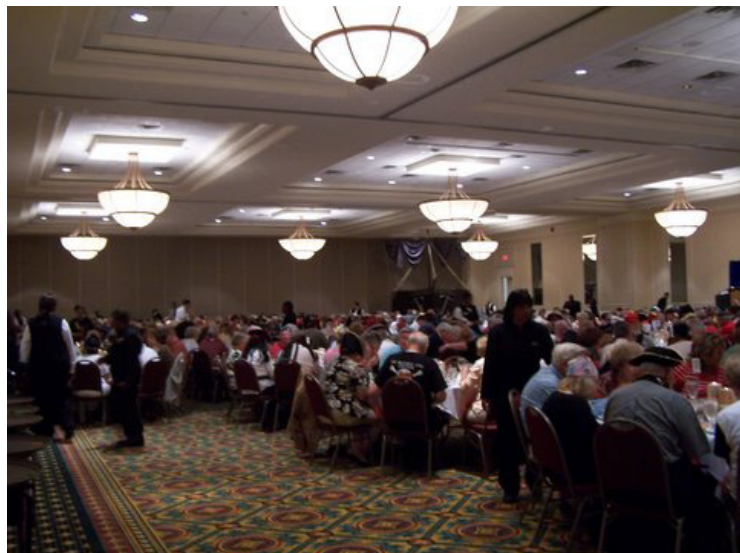
Dinner with a few good friends.