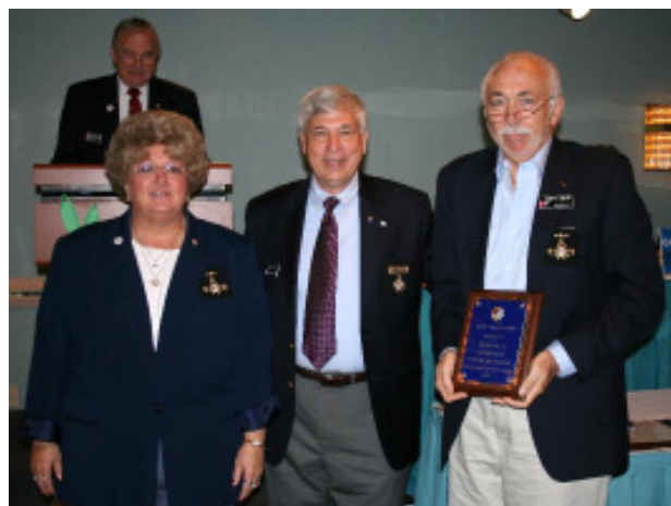
Rockville accepts award for excellence in obtaining Educational Proficiency