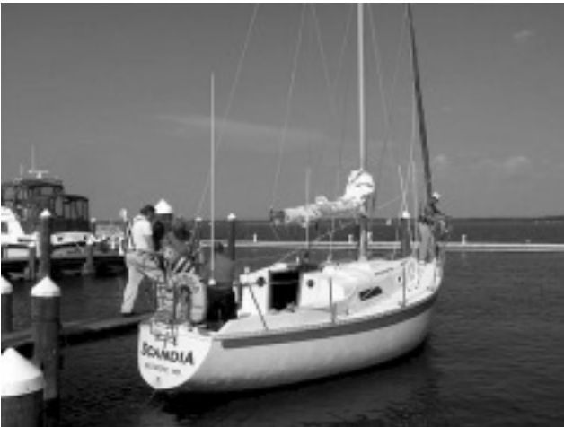
Scandia gets underway.