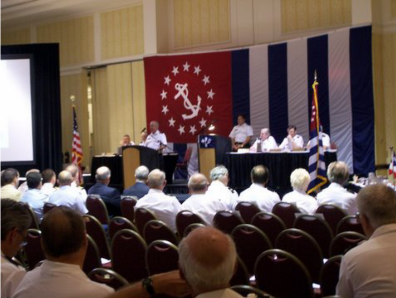
The business of the weekend is conducted in Norfolk.