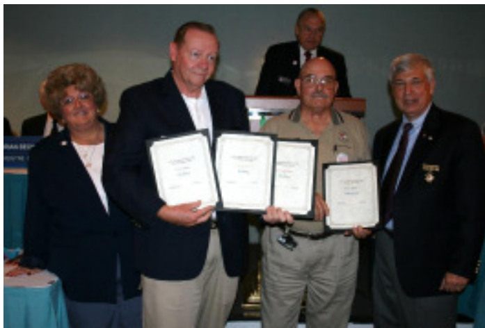
Patuxent River claims many of the Teaching Aid Awards for 2007.