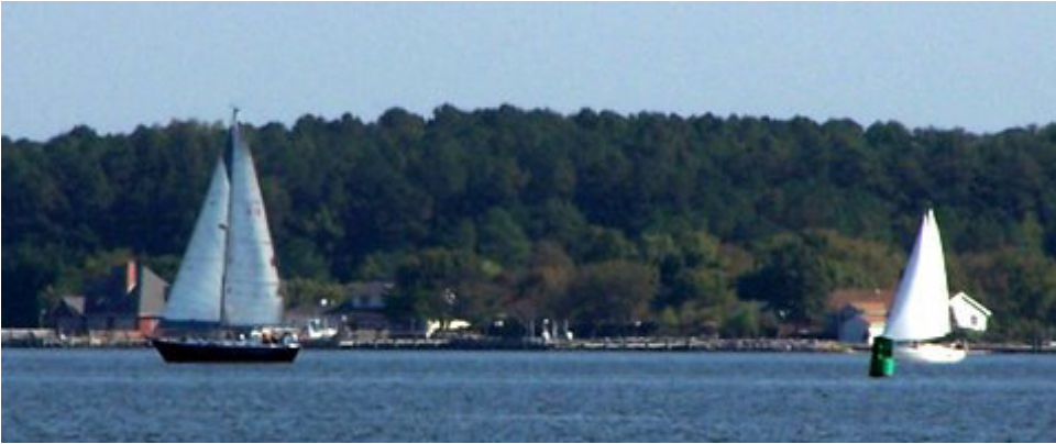
The race is on!