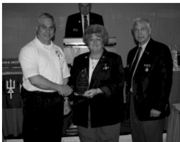
Northern Neck wins for teaching the most Advanced Courses