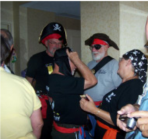
Some of these pirates bear a striking resemblance to D/5 members...