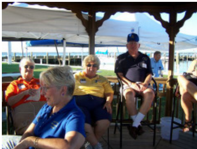
Members of the District Bridge enjoy the race - landside.

The D/5 Sail Regatta was hosted by Cambridge Sail and Power Squadron on 6 - 8 October at the Cambridge Yacht Club on the Choptank River. Festivities began on Saturday with an "Indoor Picnic", where the August-like weather made the club's air conditioning much appreciated. Everyone enjoyed the hamburgers, hotdogs, and the fixings.