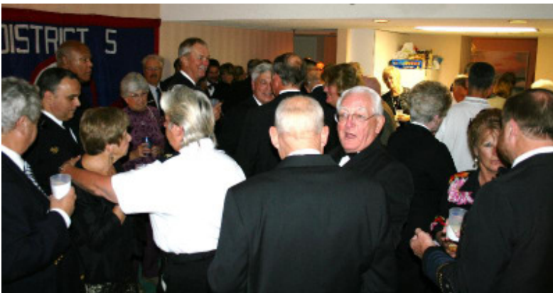
Commander's Cocktail Party