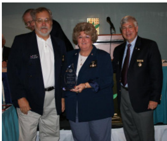
Northeast River accepts Commander's Award for teaching the most elective courses.