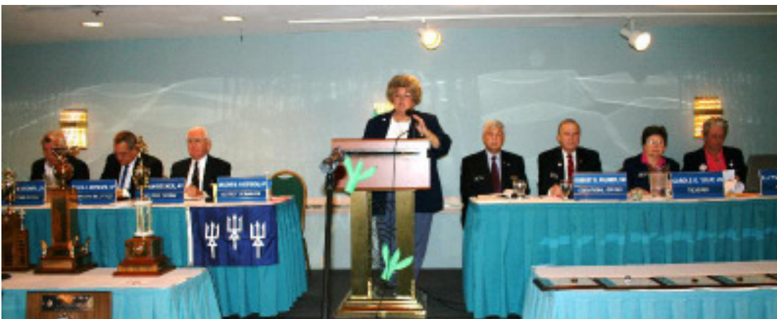
Winter Conference convenes on Sunday morning.